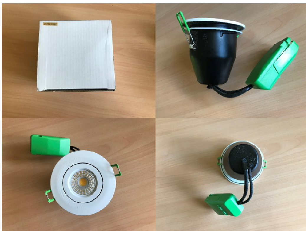
Figure 1: Photographs of JCC Lighting Products Ltd, JC010023 downlight.