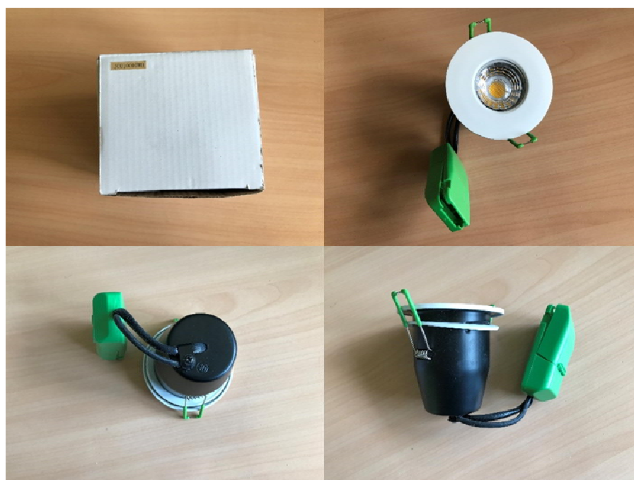
Figure 1: Photographs of JCC Lighting Products Ltd, JC010010 downlight.